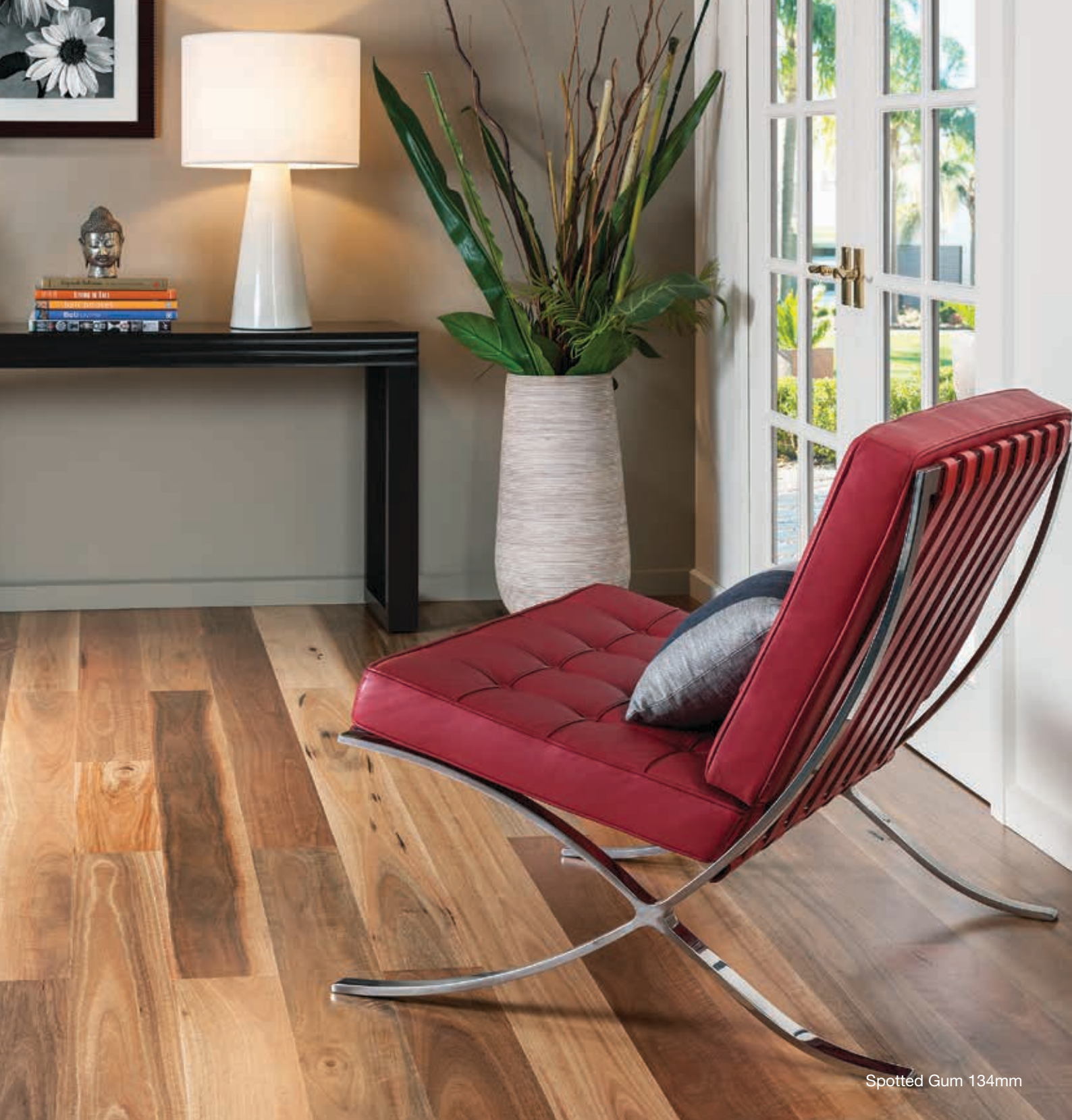
Spotted Gum 134mm

Note: Variations of colour within a timber species are normal, therefore photographs, samples and displays can only be indicative of the colour range of the timber species nominated. Timber is a natural product and commonly reacts to changes in atmospheric and environmental conditions such as humidity and temperature. This is considered normal.