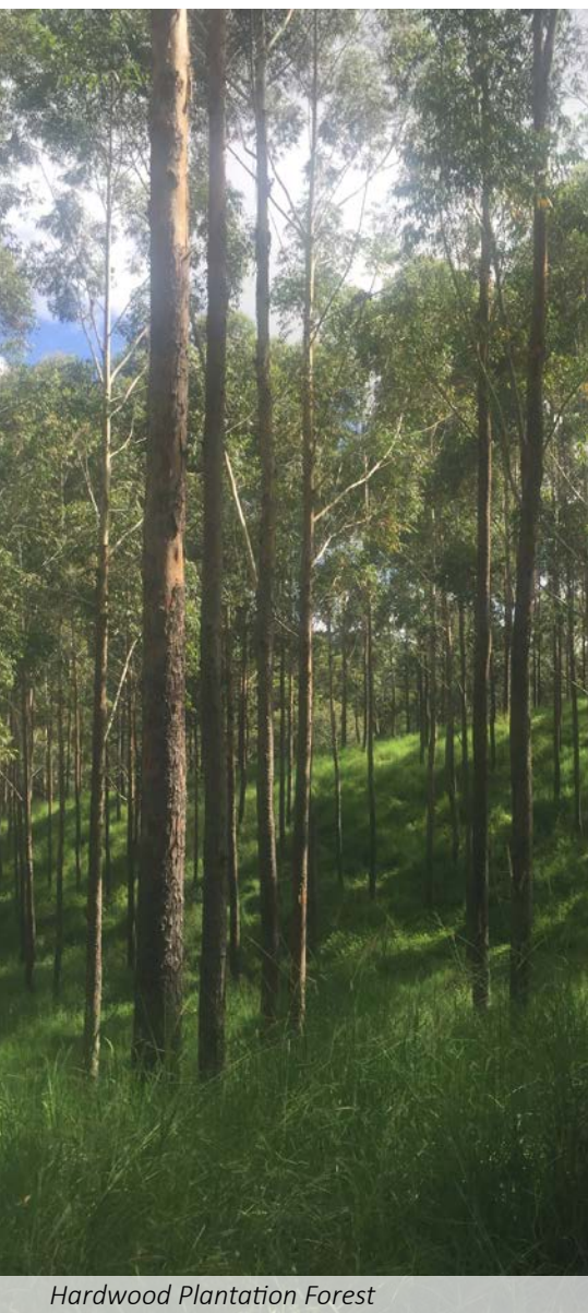
Hardwood Plantation Forest

All of whom opened an account and placed an order with us in the last month. Thank you to everyone who has loyally ordered from us in the last month – there are too many to acknowledge in a single article but we thank each of you for your business.