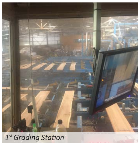
1 st Grading Station

We are grateful to Hurfords for spending the day with us to show us the ins and outs of how the tress get to be on our floors or decks etc. I am confident in saying we have all learnt a thing or 2 that will benefit us when talking to you about the Hurfords' product range.