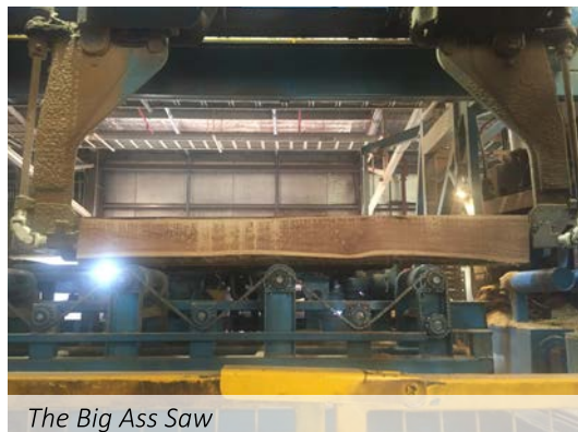
The Big Ass Saw

Once the timber has air dried and is ready for the kilns it gets sent to Tuncester to the Hurfords dry mill. So we were on the road from Kyogle to Tuncester making sure we stopped for lunch of course! ☺ This mill was pretty loud and amazing also! It was here we learnt that Hurfords have 7 kilns! The air dried timber travels to