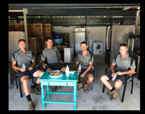
If you are on social media remember to friend/follow Wilson Timbers so we can keep you in the loop about upcoming FREEBIES and competitions.