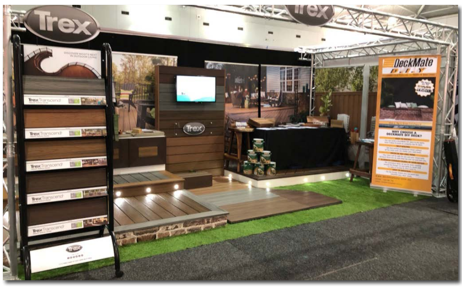
Our stand just before the doors opened

We were also reminded of just how much the man on the street loves convenience. A deck that does not require oiling is high on customers'