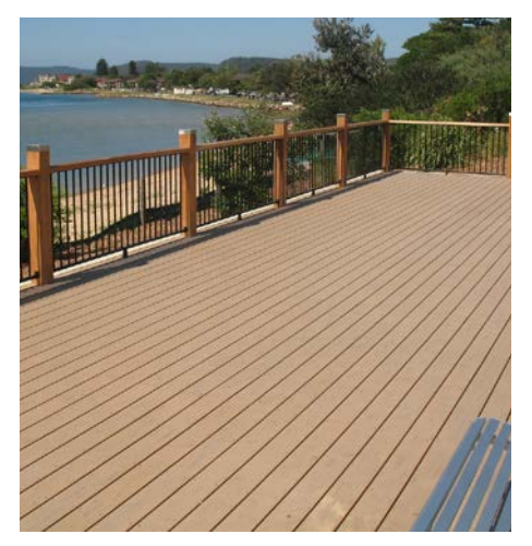
A Trex deck