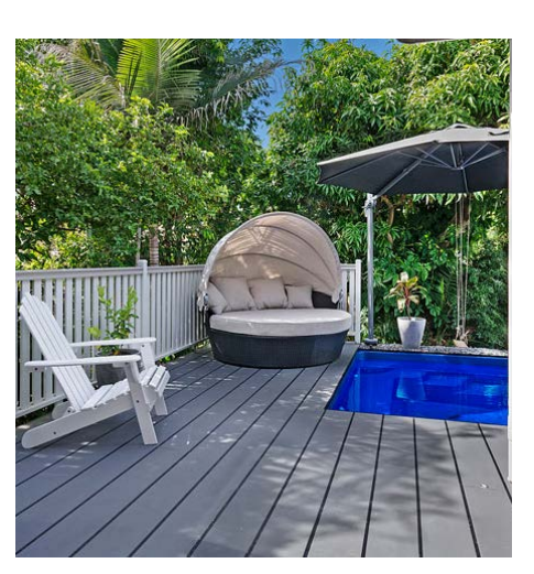
A HardieDeck deck

The next time you have a client who wants a deck that might not be optimally suited to timber make sure you talk to your rep or call 3277 1988 and we will steer you in the right direction.