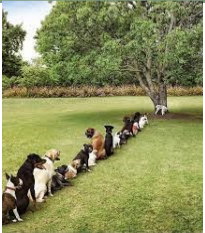
A CONSEQUENCE OF DEFORESTATION