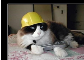
BOB TEH BUILDER CAT