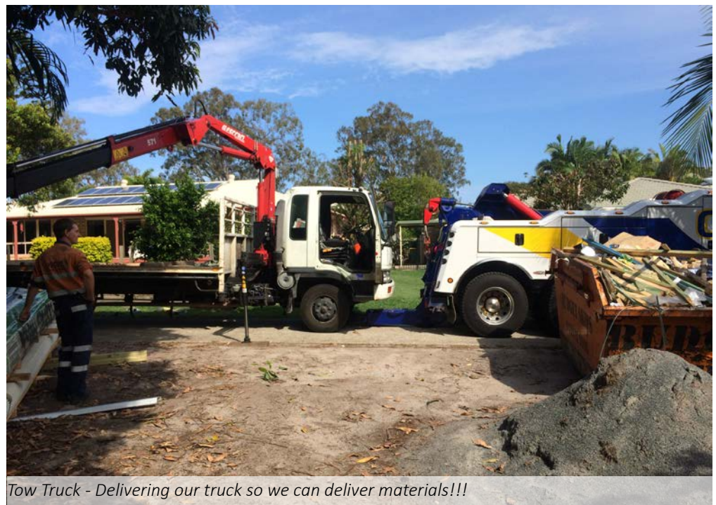
Tow Truck - Delivering our truck so we can deliver materials!!!