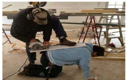
BIRTH OF THE BUILDERS CRACK