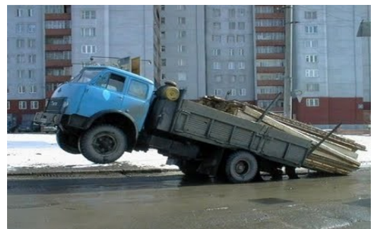
WHEELIE ON STEROIDS