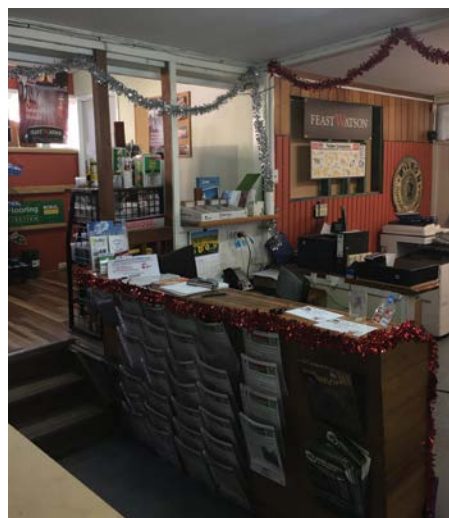
This is what it looked like before and during... you'd better swing on by for the barbie on June 30 to see the after.

There will also be demonstrations throughout the day from the likes of Soudal, Simpson Strongtie, Deckmate D.I.Y. and Tanacoat to name a few.