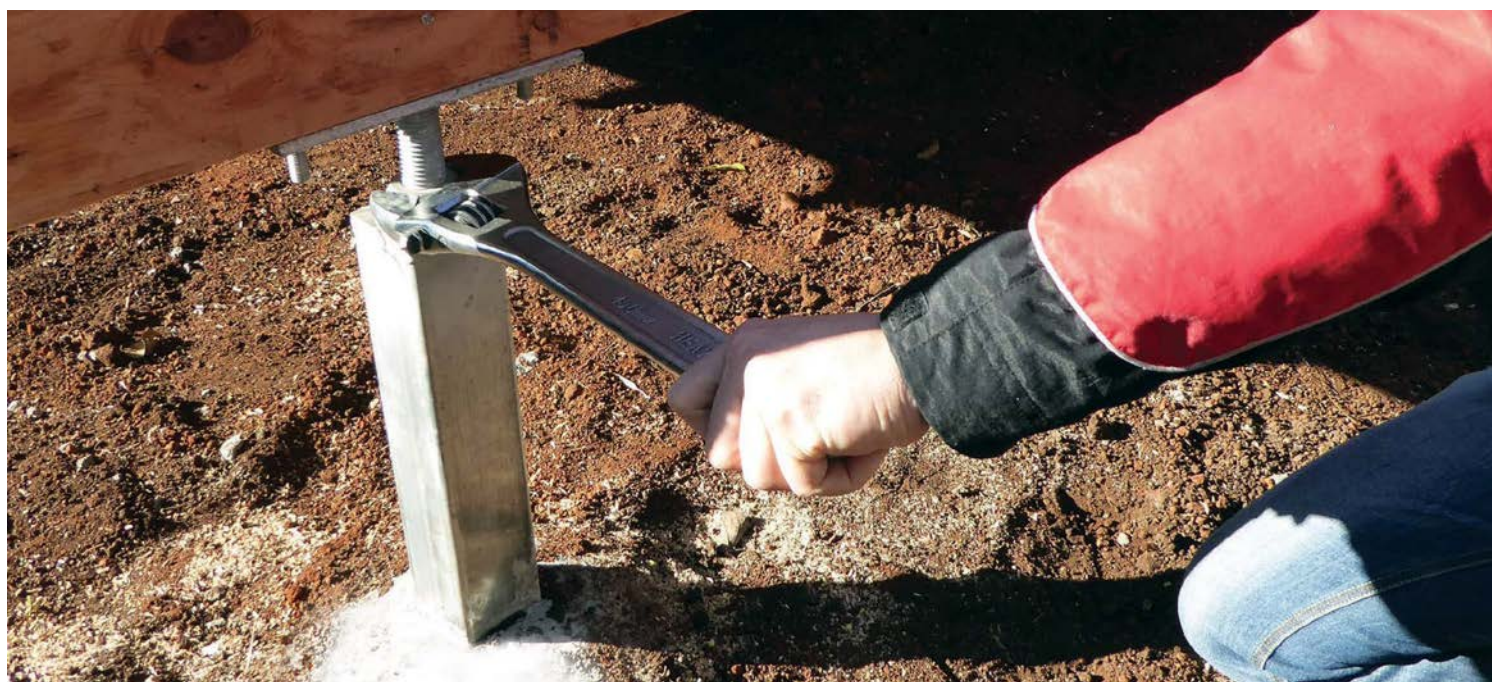
Adjust the levels of a house with a single spanner.

If you've got a photo of a dodgy tie down (or anyone doing something stupid on the job) then send it through to your rep or share it with us on our facebook page https://www.facebook.com/WilsonTimbers/