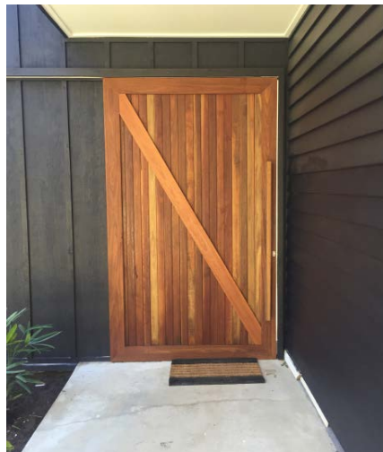
Looking sweet: A door made from our timber