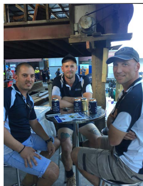
The Zoubuild boys - before they were famous (Hope you caught them on Ready Set Reno)