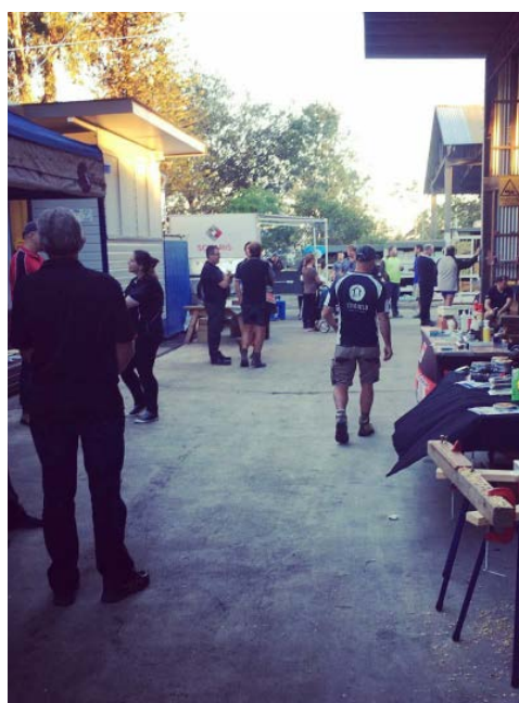
Plenty of guests and sponsors at the exhibitors hall