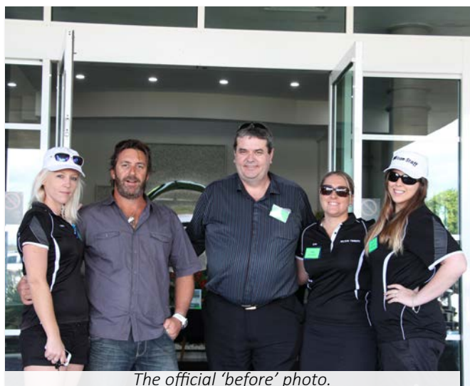
The official 'before' photo.