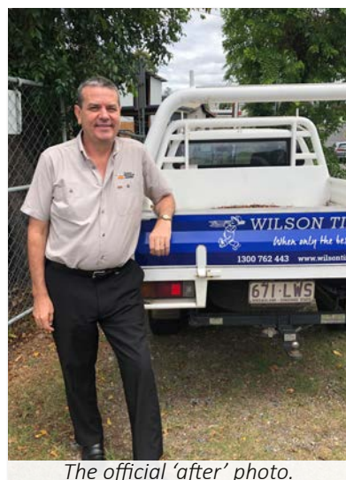
The official 'after' photo.