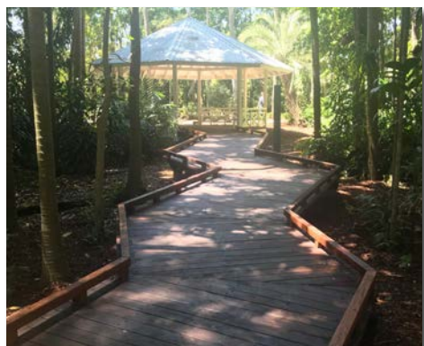
Deckwood deck at the Brisbane City Botanical Gardens.

For more information on OSA go to www.outdoorstructures.com.au or call 5462 4255. If you are want to know more about our CPD courses go to https://www.deckwood.com.au/continuing-professional-development.php