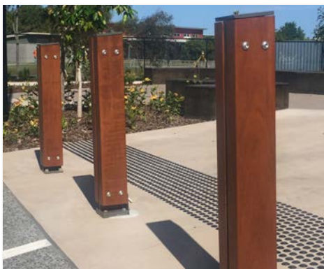
Shore Bollards at Sippy Downs