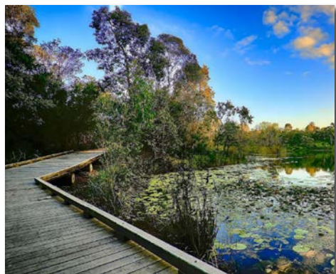
Deckwood deck at the Berrinba Wetlands