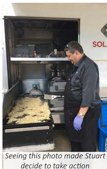
Seeing this photo made Stuart decide to take action