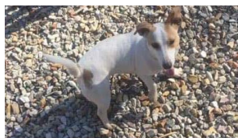
Gidget – A good mum, she's the other female Jack Russell, and has been a good breeder.