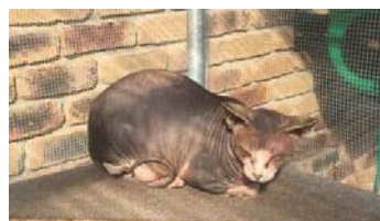
Chucky – The stud Sphinx Cat. Life is good for Chucky.