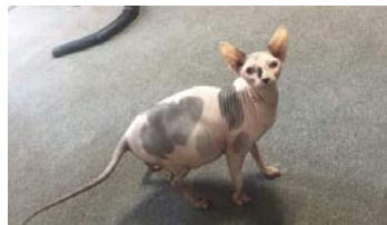
Tiffany – The oldest Sphinx cat in the house. She may be pregnant or fat. Most likely pregnant.