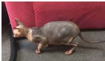
Bellatrix – The youngest breeding sphinx cat in the family. Sphinx cats are so rare here she was brought into Australia from New Zealand.