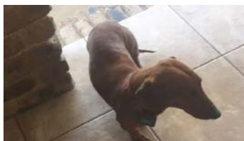
Cardiac – The family troublemaker. Always barking at the neighbour and getting the other dogs to do the same. Only gets away with it because he's a pet – not a breeding dog.