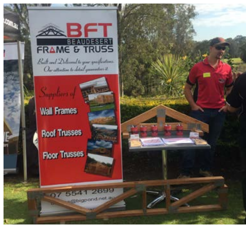
BFT Frames and Trusses