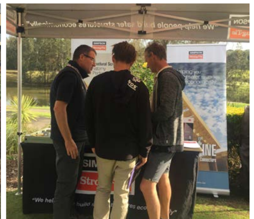
Simpson Strong Tie