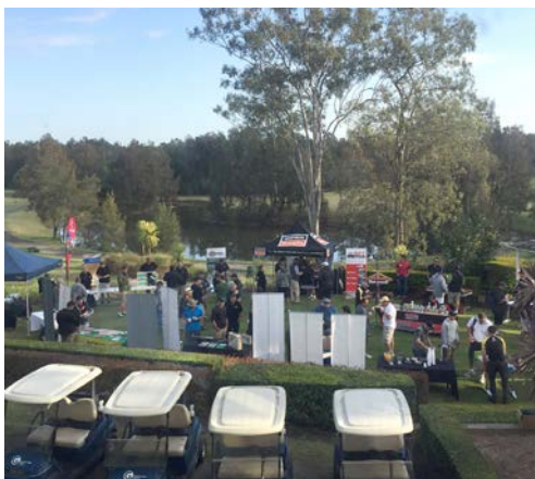
Our little on-course trade area - just in front of the clubhouse