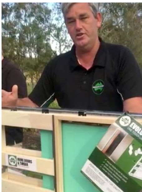
Hume Evolution Touch Slider in action.

Of course Wilson Timbers can supply these products for you. If you want to see demonstrations, need more information for yourself call 3277 1988 now and we will arrange a rep to come and visit you on site.