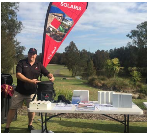
Solaris Insulated Panels