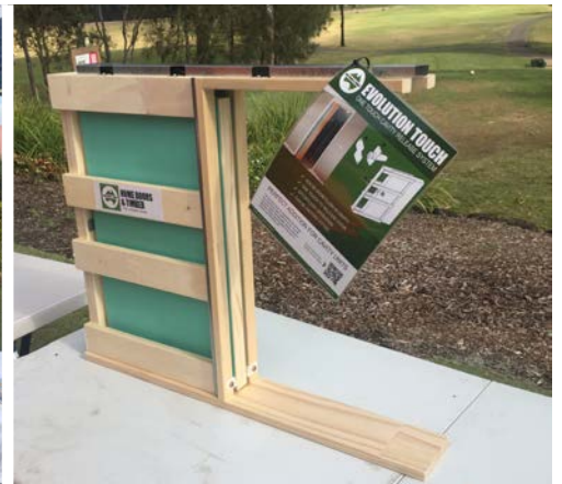
Hume Doors & Timber