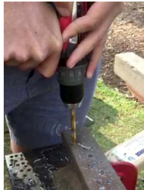
Sheffield's tynite drill bit vs railway iron.

The Sheffield Group: To demonstrate their Tynite drill bits The Sheffield group stand had a 'drill a hole in a piece of railway track' game. If you missed it, it was really impressive to see in action and all the feedback was